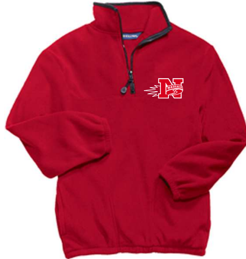
1/4 Zip Red Polar Fleece. Nassau Hockey logo embroidered on left chest.

TEAM NAME/LEVEL _____ NAME ON JACKET _____