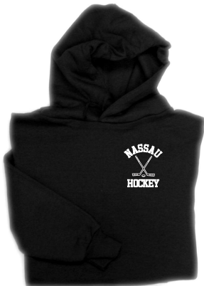
Black Hooded Sweatshirt. Nassau Hockey logo printed on left chest.