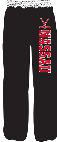
Black 50/50 Sweatpants. Covered waistband and cuffs. Inside drawstring and side entry bag pockets. Nassau\Crossed Sticks printed on left leg.