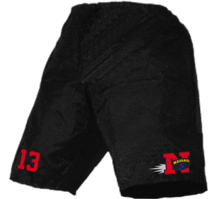
Black Nylon hockey shell. Nassau Hockey logo embroidered on left leg. 4" twill number embroidered on right leg.