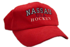
Red adjustable hat. Nassau Hockey USA embroidered on front.