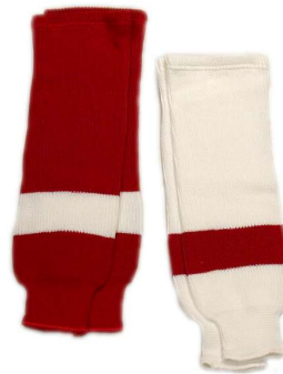
Socks. 1 Pair Red / 1 Pair White.