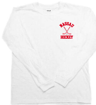
White Long Sleeve Tee Shirt. Nassau Hockey logo printed on left chest.