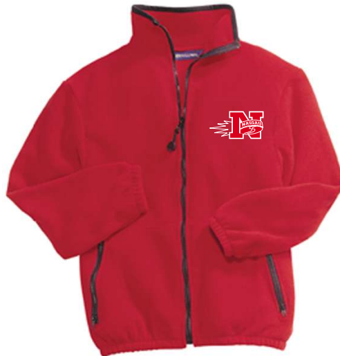
Full Zip Red Polar Fleece. Nassau Hockey logo embroidered on left chest.